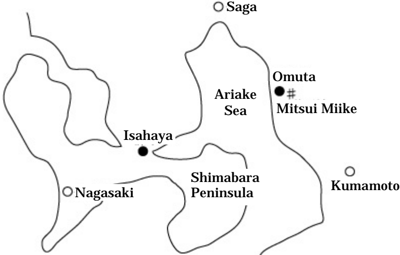
Figure 1: Location of Mitsui Miike Coal Mine

An explosion occurred in a mine tunnel at Mitsui Miike coal mine (Figure 1) roughly 500 meters below the mine ground-level entrance. The blast and flame caused roof fall in many areas in the tunnels, which then quickly filled with carbon monoxide. 458 people were killed and 555 people were injured. It was the worst postwar mine disaster. Lack of safety provisions was the primal cause. Figure 2 indicates the cross-section of the accident site. The coal beds at Mitsui Miike sloped towards Ariake Sea, and mine openings had also shifted over time towards the sea (to the left in the figure) from mountainside. At the time, coal beds roughly 350 to 450 meters below the sea level were being mined.